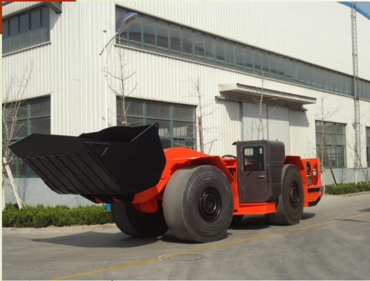
Diesel Loader HKWJ-6 Tramming Capacity:14000kg