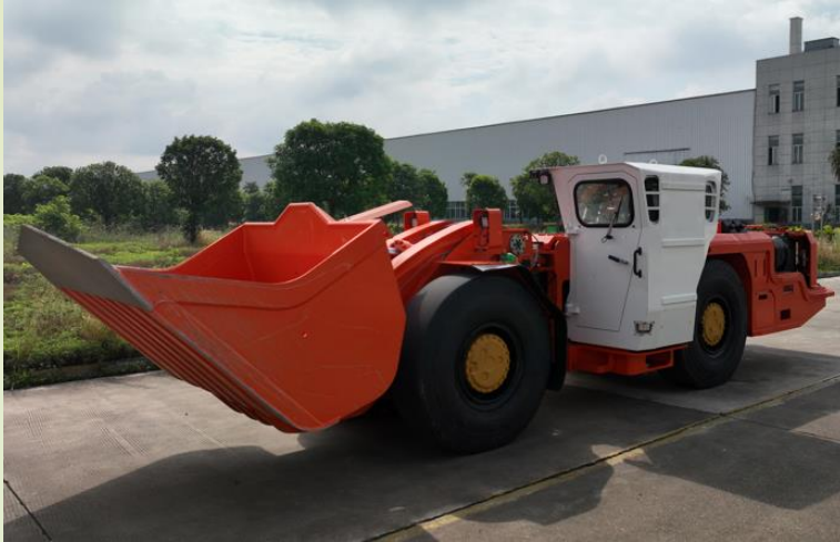
Diesel Loader HKL-7 Tramming Capacity:7000kg