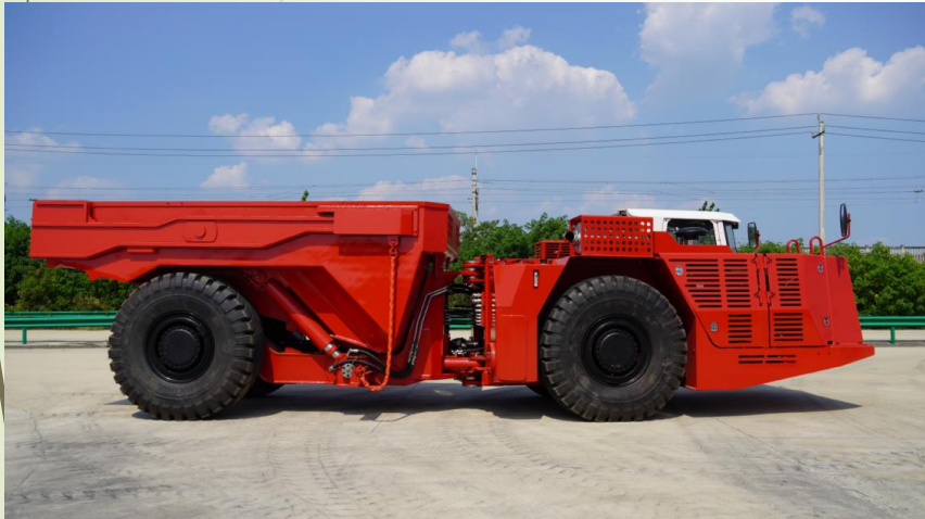
Dump Truck HKUK-30