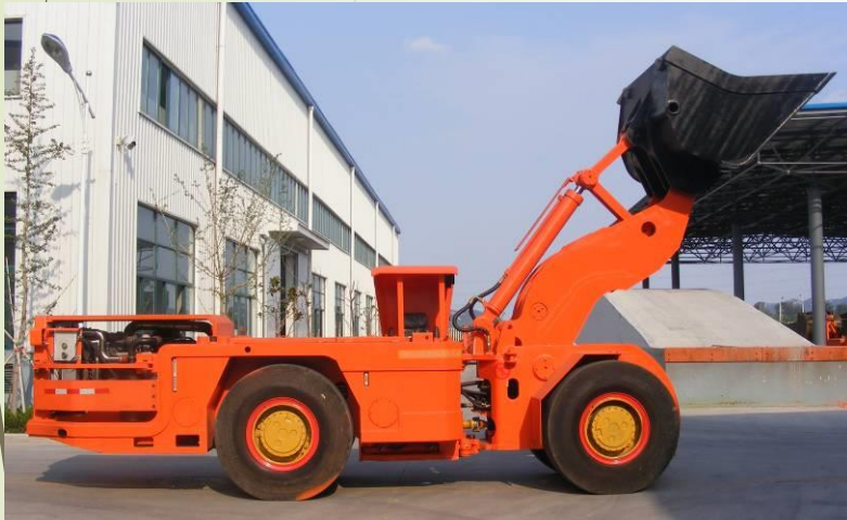
Diesel Loader HKWJ-3.5L (Long arm) Tramming Capacity: 7000Kg