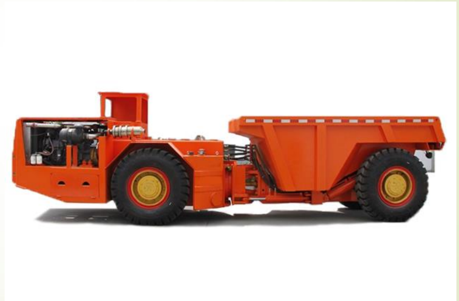
Dump Truck HKUK-8/10/12