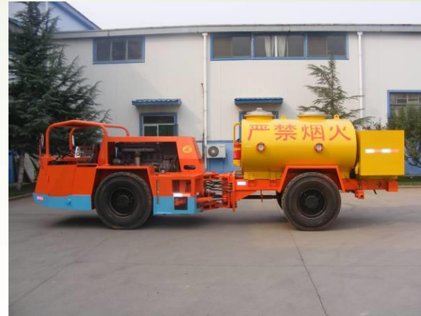
Utility Vehicle (Oil Tank Truck) HKJY-5