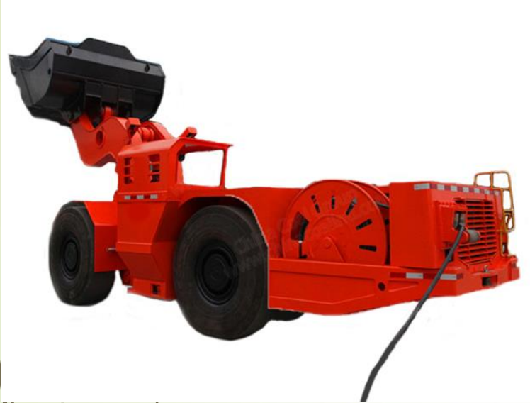
Electric Loader HKWJD-4 Rated Loading Capacity: 10000Kg