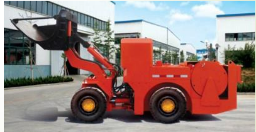
Electric Loader HKWJD-0.6C Rated Loading Capacity: 1200Kg