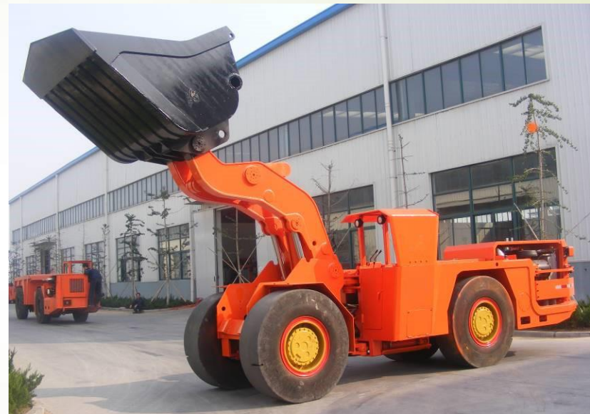
Diesel Loader HKWJ-3B (Big Arm) Tramming Capacity: 6000Kg