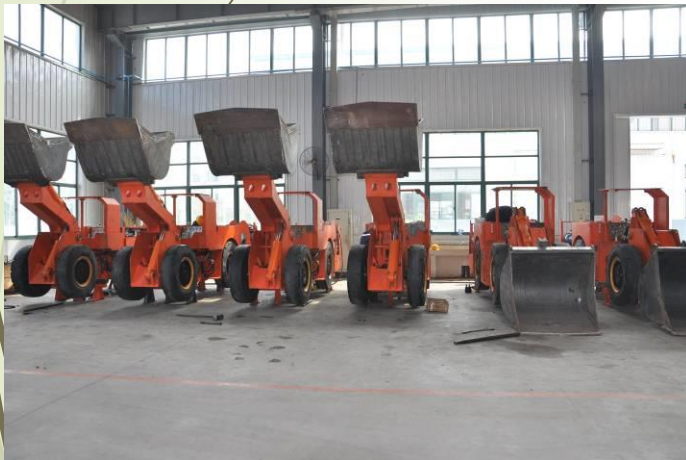
Assembly Workshop No.2