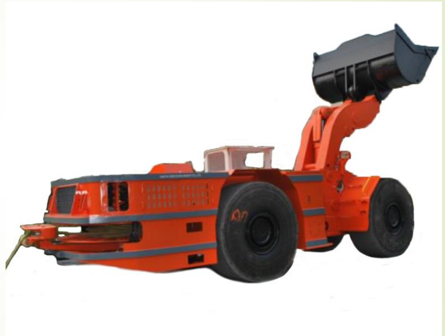
Electric Loader HKWJD-6 Rated Loading Capacity: 10000Kg