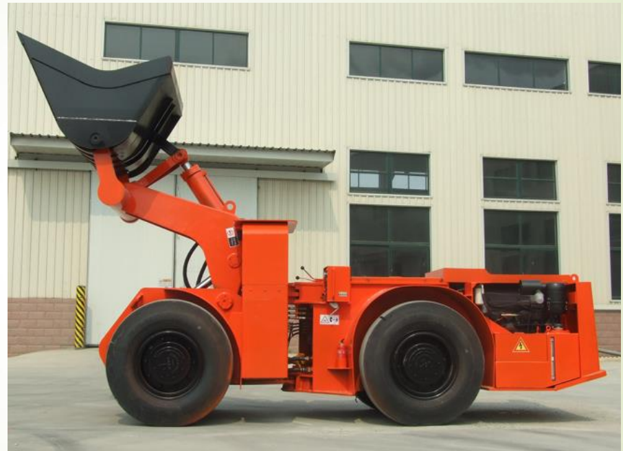
Diesel Loader HKWJ-2 (Air cooling) Tramming Capacity: 4000Kg