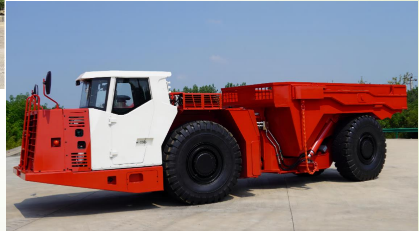
Dump Truck HKUK-20