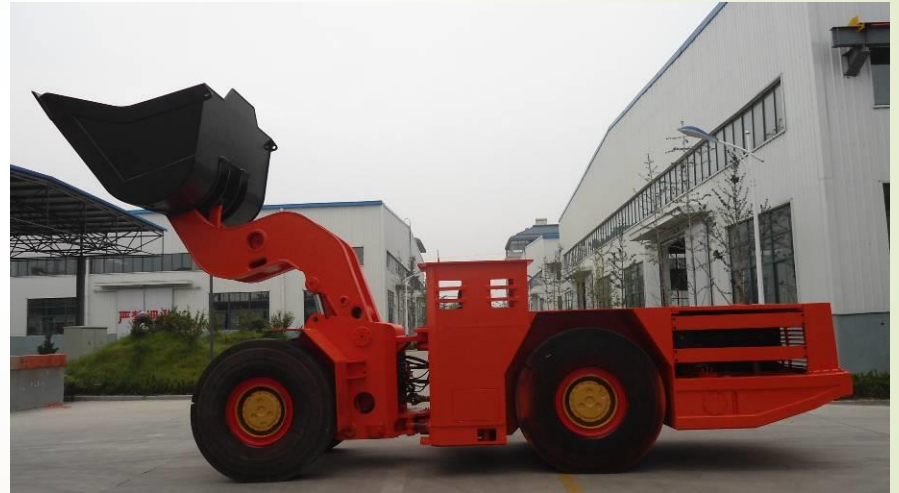
Diesel Loader HKWJ-4 Tramming Capacity: 8000Kg