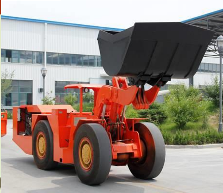
Diesel Loader HKWJ-1.5 Tramming Capacity: 3000Kg