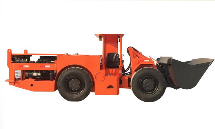
Diesel Loader HKWJ-1(0.75) Tramming Capacity: 2000Kg