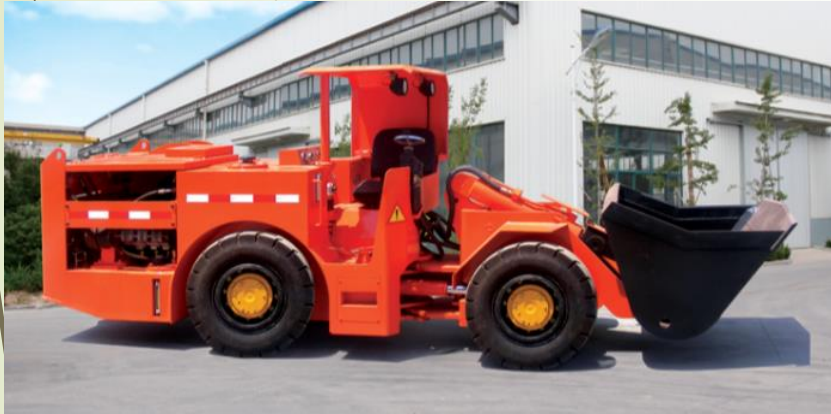
Electric Loader HKWJD-0.6 Rated Loading Capacity: 1200Kg

◆ Underground cable-electric Loader series products mainly consist of HKWJD-0.6, HKWJD-0.75(1), HKWJD-1.5, HKWJD-2, HKWJD-3L, HKWJD-4, and HKWJD-6