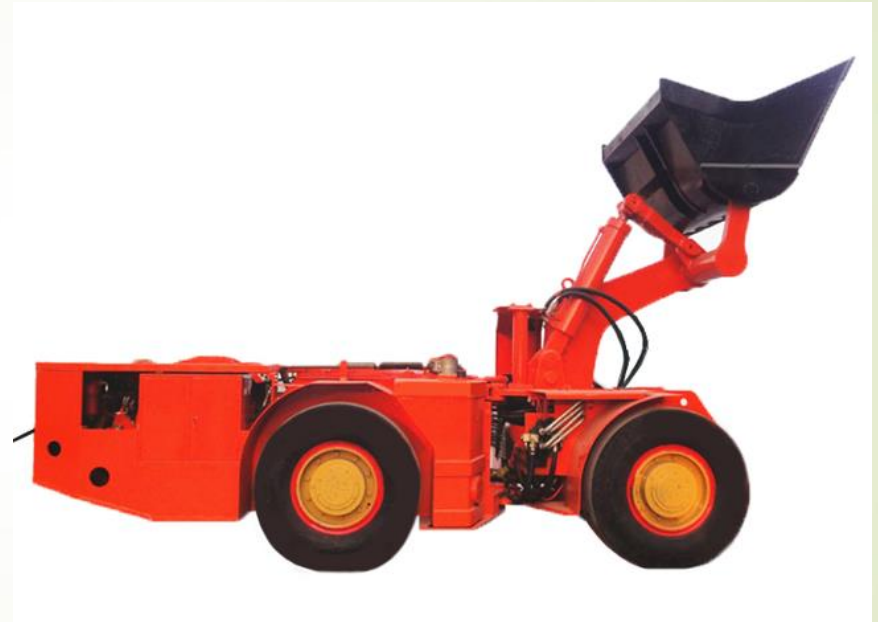
Electric Loader HKWJD-2 Rated Loading Capacity: 4000Kg