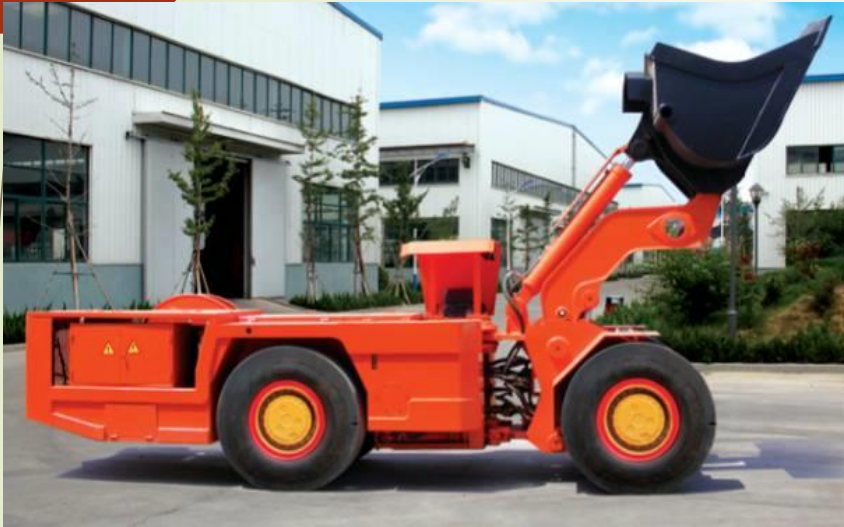
Electric Loader HKWJD-3 Rated Loading Capacity: 6000Kg