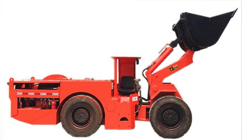
Electric Loader HKWJD-1C Rated Loading Capacity: 2000Kg