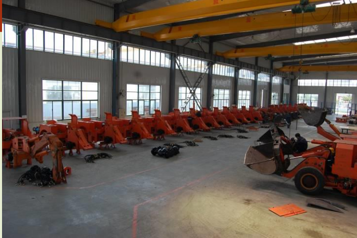
Assembly Workshop No.1