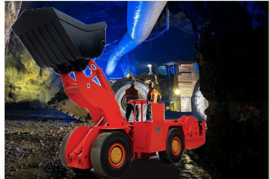
Electric Loader HKWJD-3L Rated Loading Capacity: 6000Kg