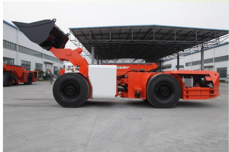
Diesel Loader HKDC-5 Tramming Capacity:5000kg