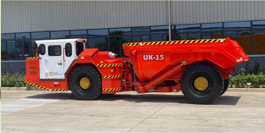
Dump Truck HKUK-15