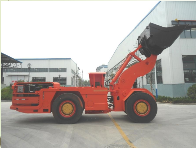
Diesel Loader HKWJ-3 Tramming Capacity: 6000Kg