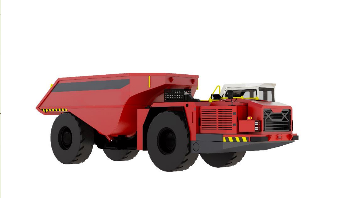
Dump Truck HKUK-50