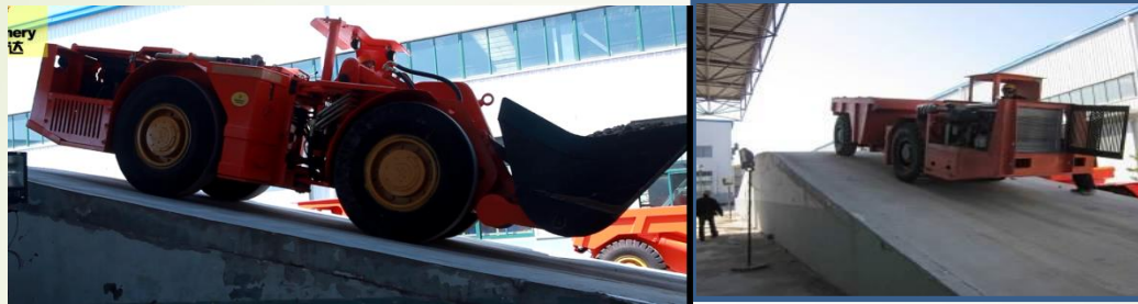
Testing & Debugging