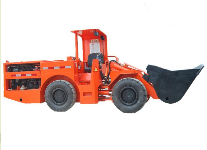
Diesel Loader HKWJ-0.6 Tramming Capacity: 1200Kg