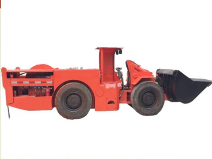
Electric Loader HKWJD-1 (0.75) Rated Loading Capacity: 2000Kg