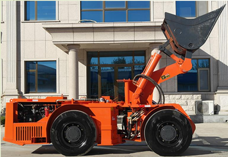
Diesel Loader HKWJ-2 (water cooling) Tramming Capacity : 4000Kg