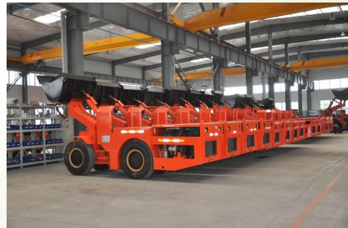
Assembly Workshop No.4