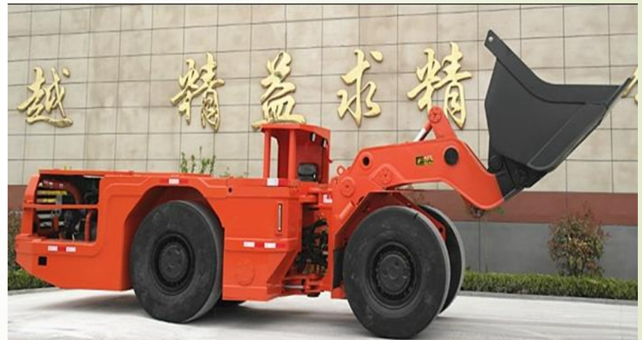
Diesel Loader HKWJ-3 Tramming Capacity: 6000 Kg