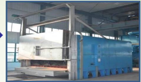
Annealing Furnace (welding stress and distortion relief)