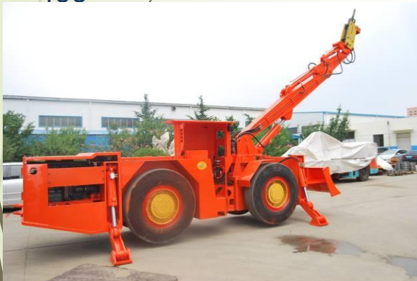
Vibratory Pick Scaler HKQM-200