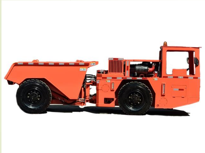
Dump Truck HKUK-5/6