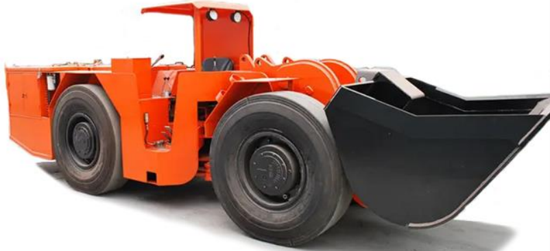
Electric Loader HKWJD-1.5 Rated Loading Capacity: 3000Kg