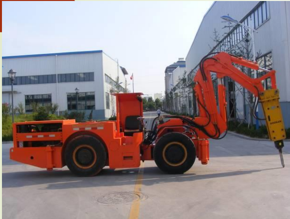
Rock Breaker HKSJ-400