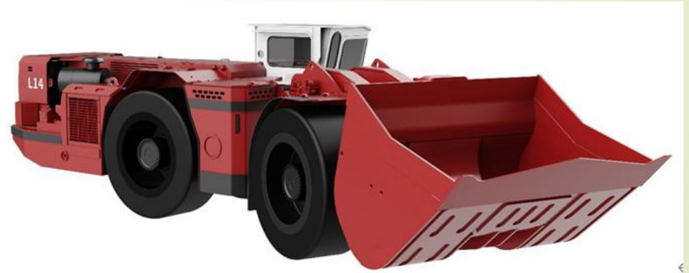
Diesel Loader HKL-14 Tramming Capacity:14000kg