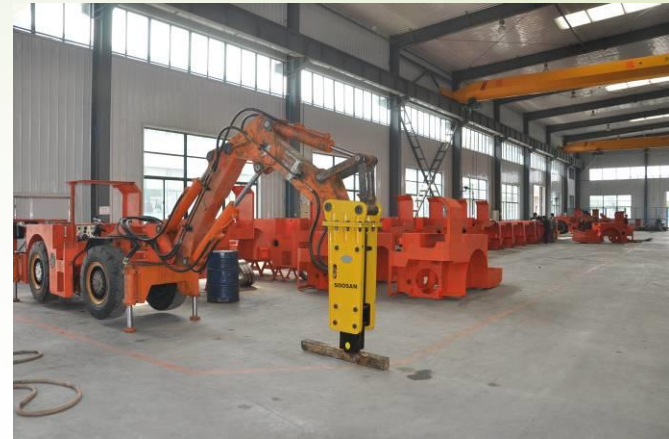
New Products R&D Workshop