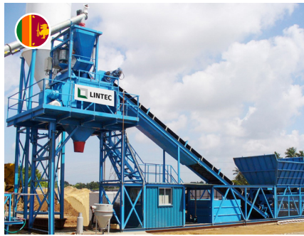
PCP Portable Concrete Batching Plant