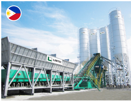
PCP Portable Concrete Batching Plant