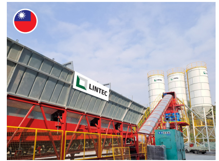
PCP Portable Concrete Batching Plant