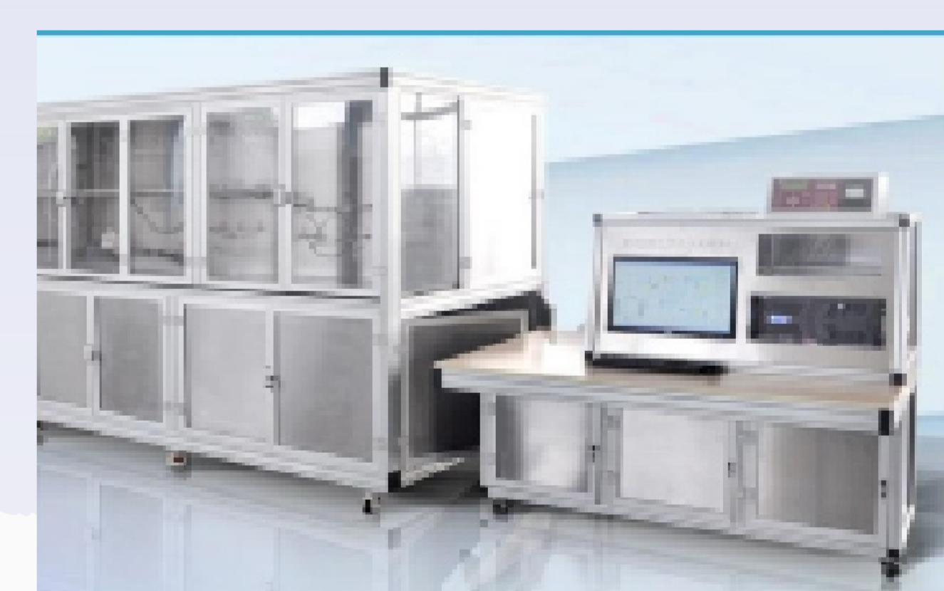
Filtration efficiency multi pass test bench