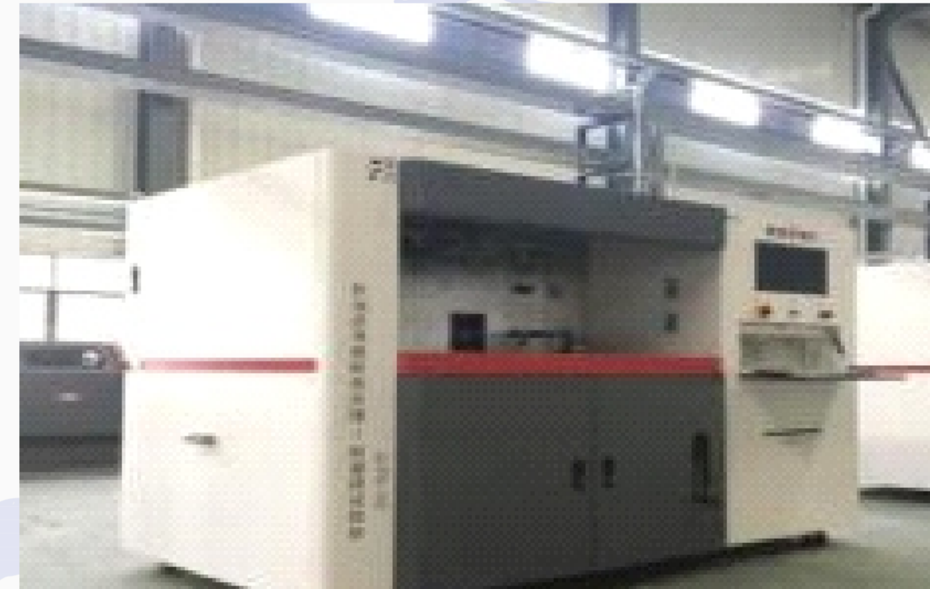
Blasting test bench