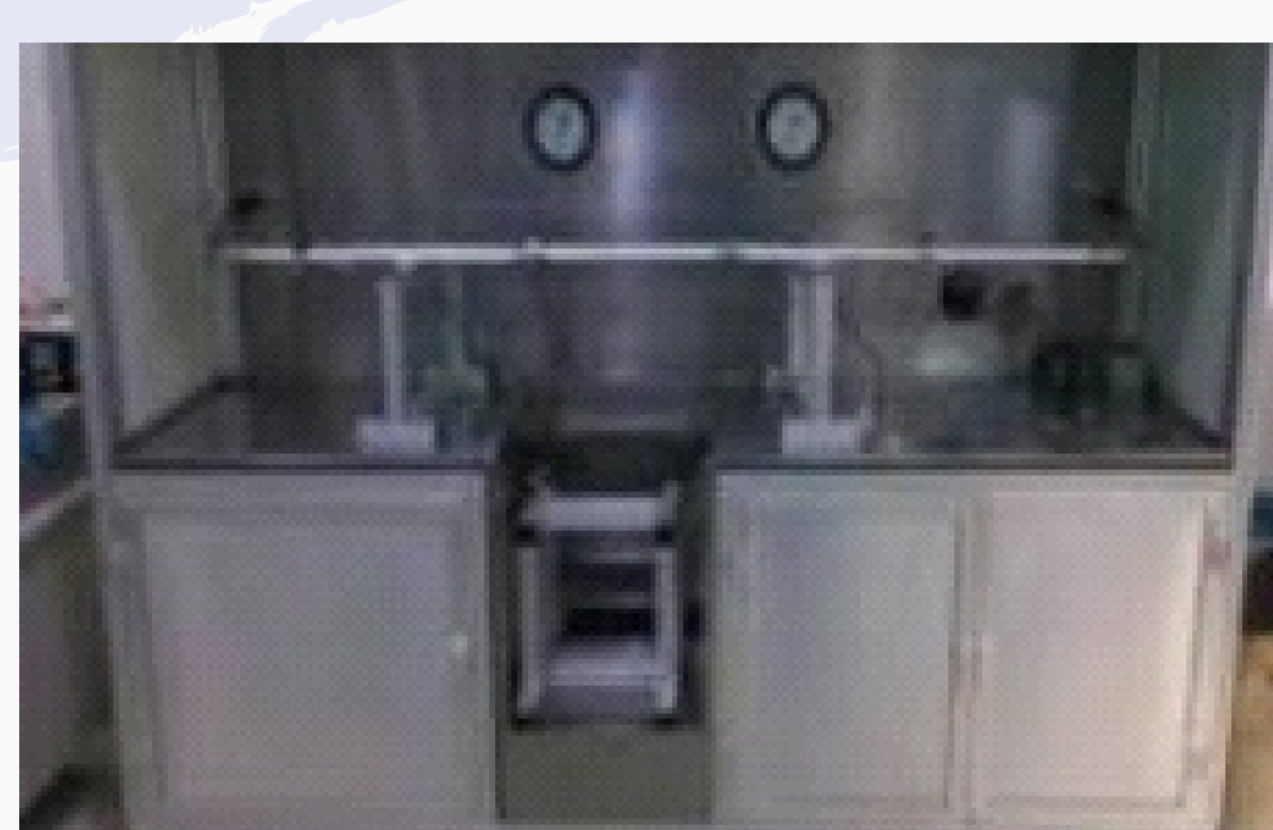
Bypass valve test bench