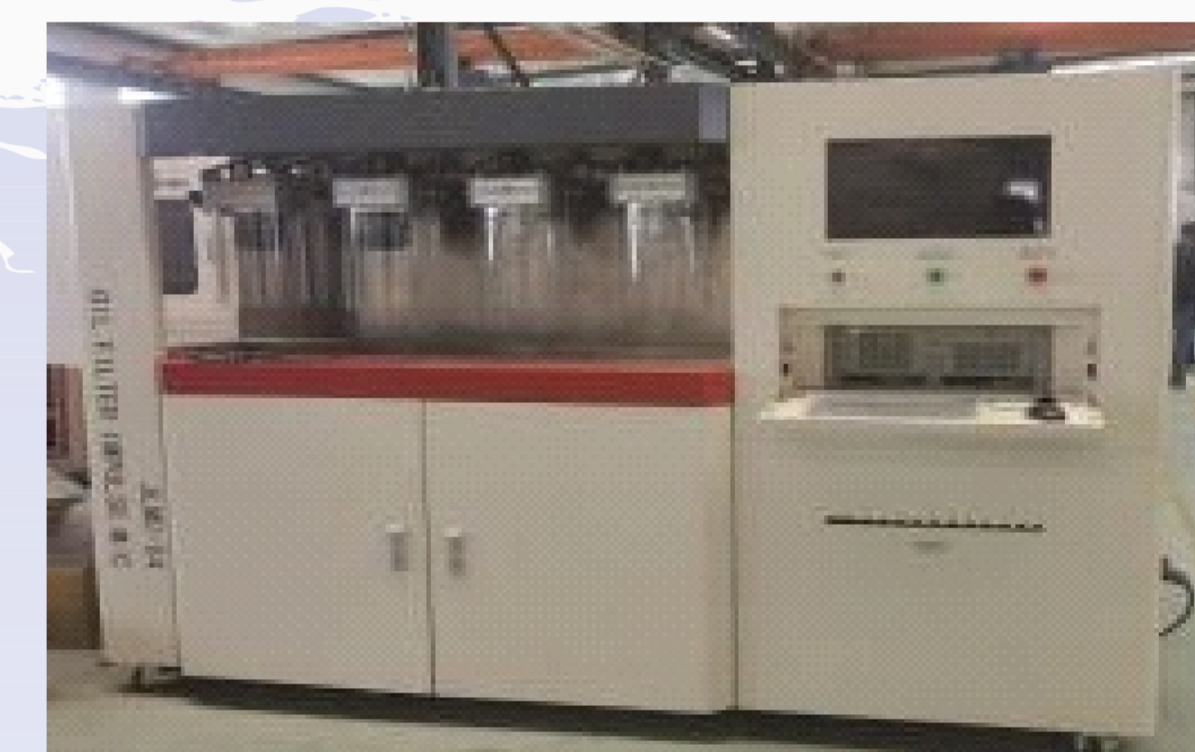
Liquid fatigue strength test bench