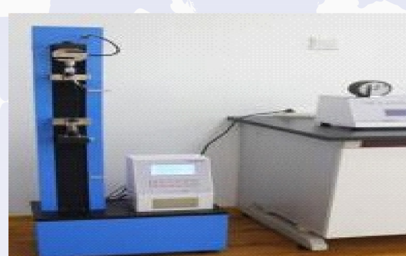
Tension test bench