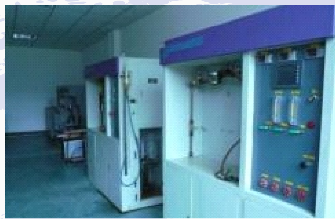
Fuel oil original resistance testing bench