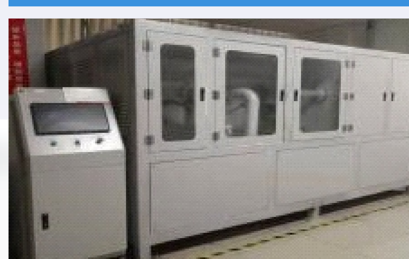
Hydraulic filter breaking test bench