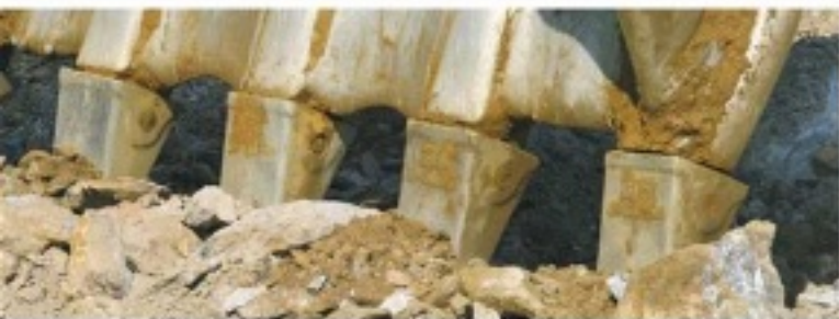
EX) GETT4 Material