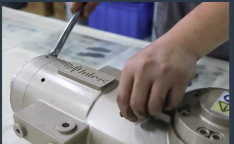
Specialized maintenance tools to ensure excellent performance and safe use of the rock drill.