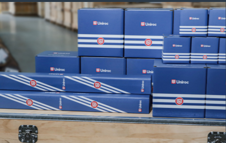
Two preventive maintenance packages are available to ensure rock drill service life.