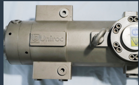
Superior material selection, low wear and tear, easy maintenance.