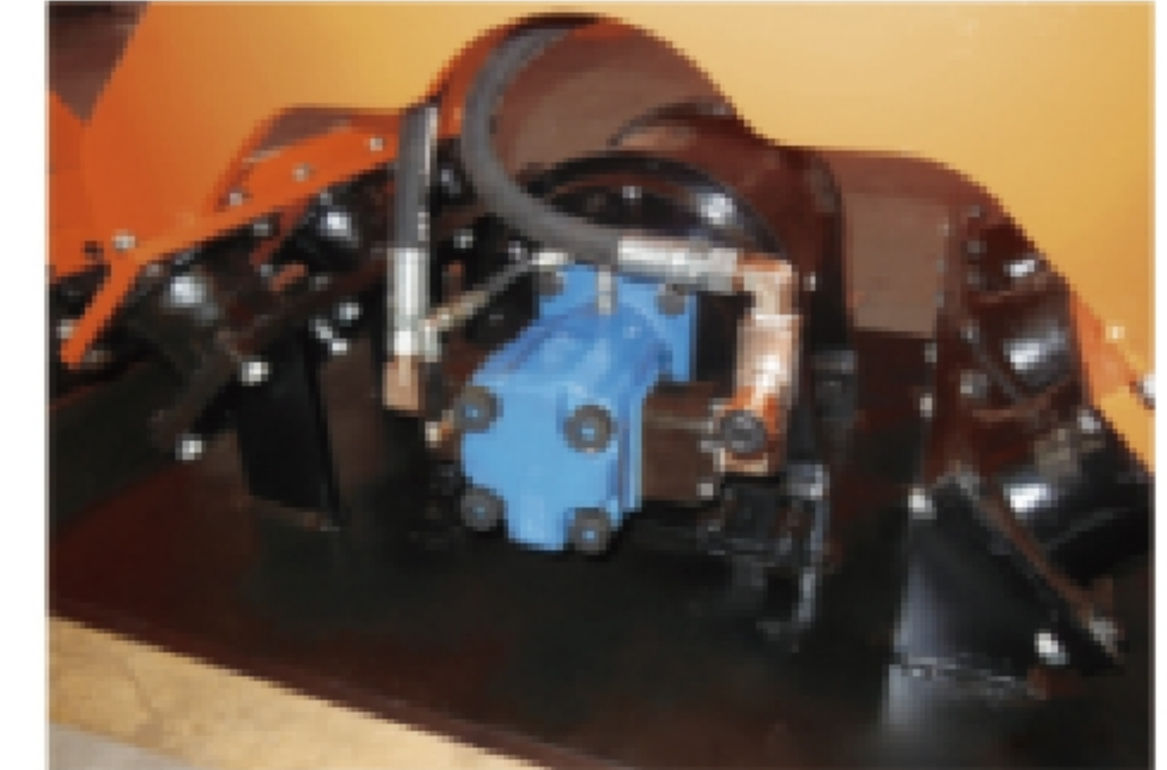
原装进口马达，更加稳定有力 PERMCO motor,stable and powerful