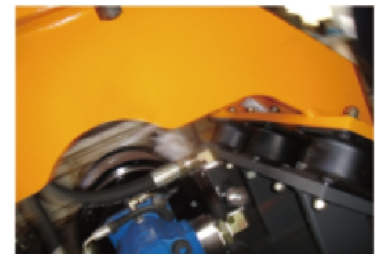
减震胶块更持久耐用 Long service life rubber pads.