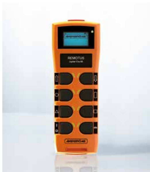
*Additional functions can be enabled via shift-function. Settings via display menu.