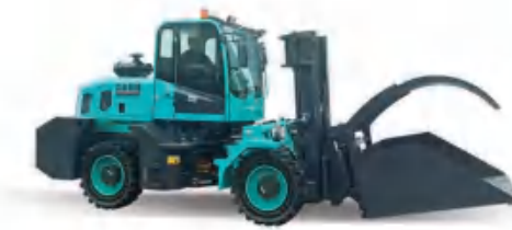
Dustpan tilts up and grabs