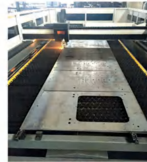
Accurate and efficient laser cutting equipment

Specializing in the development and production of construction machinery, we have advanced experience and strong strength in the design and manufacture of construction machinery, and meets the needs of friends from all walks of life with high technology, high quality, high performance and first-class service. Our products sell well all over the country and are imported and exported to many countries and regions. There are dozens of after-sales service points and parts supply outlets in China and around the world, providing you with comprehensive technical consulting services and solving problems for you in the shortest time.