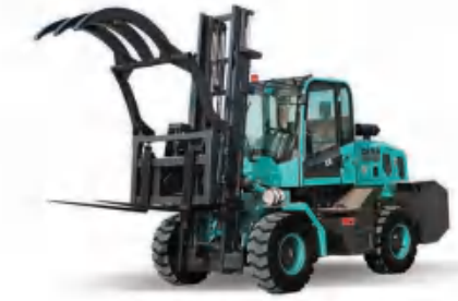
Tilting three-tooth catch