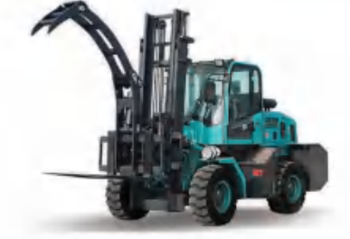
Rollover steel pipe clamp