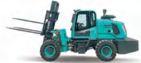
Three-tooth cotton fork