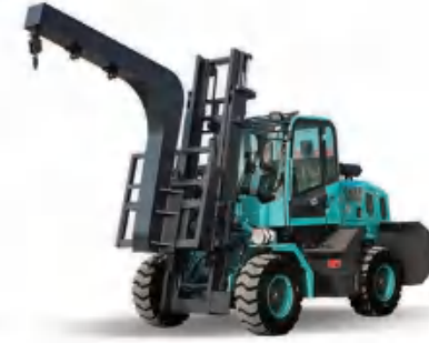
Tilting vertical jib