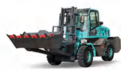
Quick Change Construction Buckets