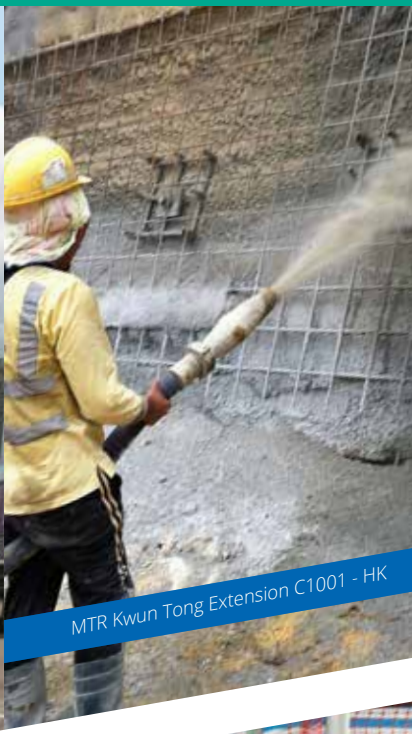
MTR Kwun Tong Extension C1001 - HK