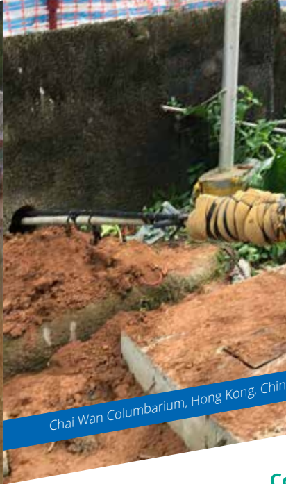
Chai Wan Columbarium, Hong Kong, China