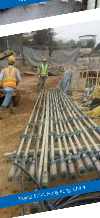
Project 823A, Hong Kong, China