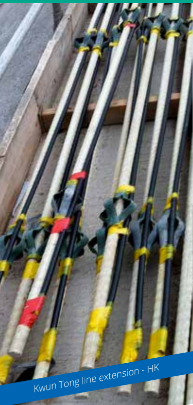
Kwun Tong line extension - HK