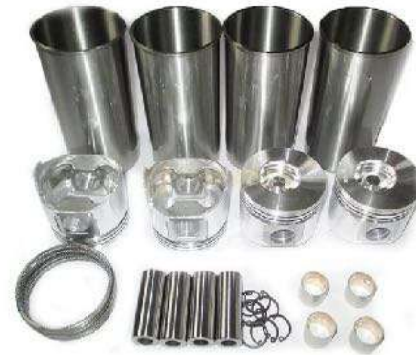
LINERS & CYLINDER KITS