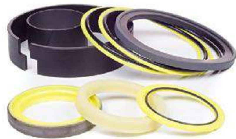
SEALS & HYDRAULIC KITS