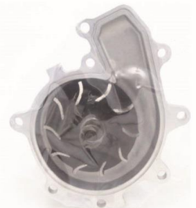
5-87610089-0 水泵 WATER PUMP