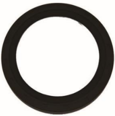
8-97602378-1 曲轴后油封 SEAL; OIL, CRANKSHAFT FRT