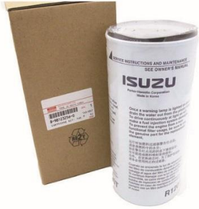
8-98123256-0 油水分离器芯 CARTRIDGE KIT; FUEL FILTER