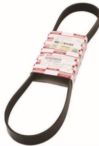
5-87610058-0 风扇皮带 FAN BELT