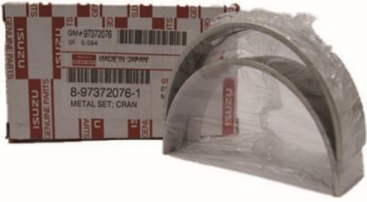
8-97372076-1 曲轴瓦 CRANKSHAFT,STANDARD