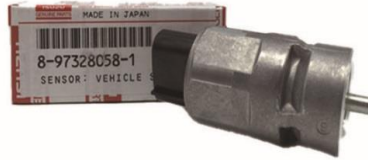
8-97328058-1 里程表传感器 SENSOR; VEHICLE SPD