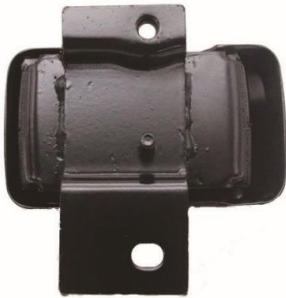
5-87610192-0 前支脚橡胶垫 RUBBER; ENG FOOT, FRT