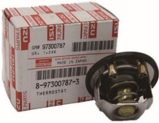
8-97300787-3 节温器 THERMOSTAT