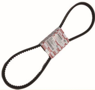
1-87610072-0 风扇皮带 FAN BELT