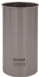
1-87618204-0 缸套 LINER;C/BL