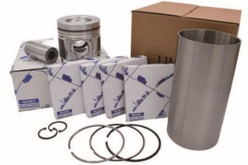
1-87618385-0 发动机活塞组件 PISTON SET