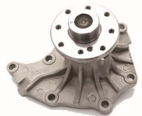
5-87610088-1 水泵 PUMP ASM; WATER, W/GASKET