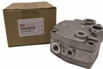
8-97614055-0 打气泵缸盖 HEAD ASM; CYL,AIR CMPR