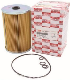
1-13240244-0 柴油滤芯 FUFL FILTER