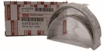
8-97372076-1 曲轴瓦 CRANKSHAFT, STANDARD