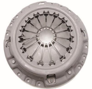
5-87610104-0 离合器压板总成 PLATE ASM; PRESSURE, CLU