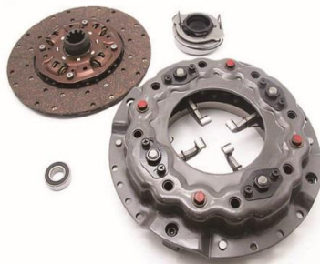
5-87610234-0 离合器套件 CLUTCH KIT