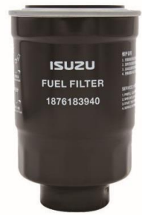
1-87618394-0 滤芯; 燃油滤清器 ELEMENT LIT;FUEL FILTER