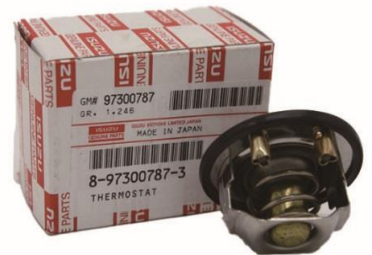
8-97300787-3 节温器 THERMOSTAT