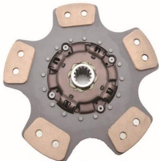
5-87610105-0 离合器片 DISC; CLUTCH