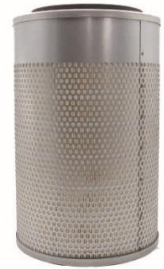
1-87610117-0 空气滤清器 FILTER; ACL, OUTER