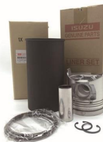
1-87813766-1 缸套组件 LINER SET; ENG CYL