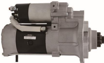
1-87618275-0 起动机总成 STARTER ASM