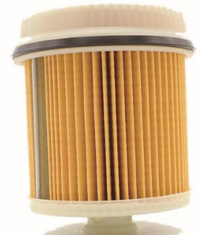
1-87610093-0 滤芯; 燃油滤清器