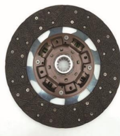
5-87610092-0离合器片 CLUTCH DISC