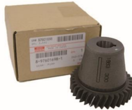
8-97601698-1 高压油泵齿 GEAR; PUMP