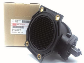
8-97240057-0 空气流量计 SENSOR; AIR FLOW CONT