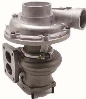
1-87610261-0 涡轮增压器总成 Turbocharger assembly