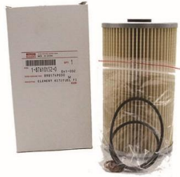
1-87610152-0 滤芯 ELEMENT KIT; FUEL FILTER