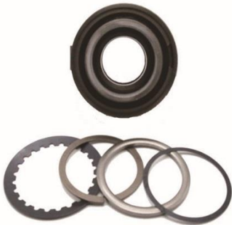
1-87611004-0 分离轴承 BEARING; RELEASE