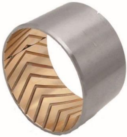
1-87610177-0 衬套 BUSHING; TRUNNION SHAFT