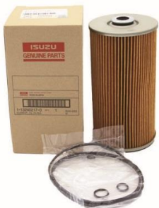
1-13240217-0 机油滤芯 ELEMENT; OIL FILTER