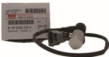
8-97306113-1 曲轴位置传感器 SENSOR; CRANK ANGLE