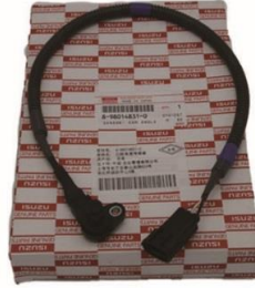
8-98014831-0 凸轮轴角度传感器 SENSOR; CAM ANGLE