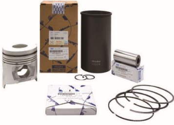
1-87618246-0 发动机钢套组件 LINER SET;ENGCYL