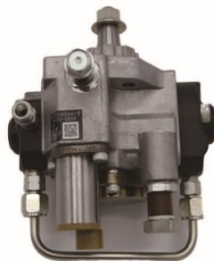
8-97306044-9 高压油泵 PUMP ASM; INJ