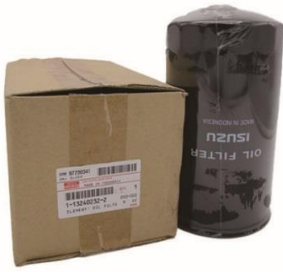
1-13240232-2 机油滤芯 ELEMENT; OIL FILTER