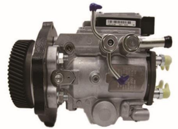
8-97252341-5 高压油泵 PUMP ASM; INJ