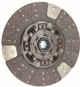
1-87611002-0离合器片 CLUTCH DISC