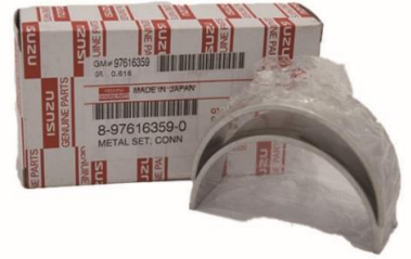
8-97616359-0 连杆瓦 CONN ROD, STANDARD