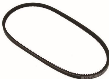
5-87610052-0 皮带; 冷却风扇 BELT; COOLING F