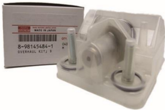
8-98145484-1 高压油泵修理包 OVERHAUL KIT; SUPPLY PUMP