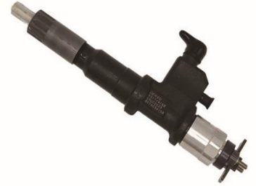
8-97603415-8 喷油嘴总成 NOZZLE ASM; INJ