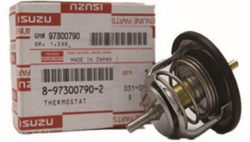
8-97300790-2 节温器 THERMOSTAT