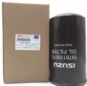
1-87611007-0 机油滤芯 OIL FILTER