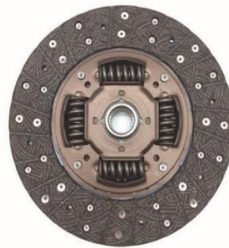
5-87610083-0离合器片 CLUTCH DISC