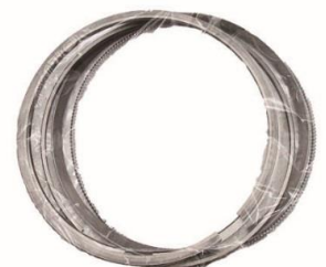
1-12121154-1 活塞环 RING SET; PISTON, STANDARD