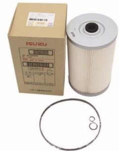
1-13240241-0 机油滤芯 ELEMENT; OIL FILTER