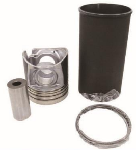
1-87812928-1 缸套组件 LINER SET; ENG CYL