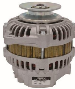
1-87618279-0 发电机总成 GENERATOR ASM