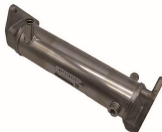
8-97378939-3 废气循环管 COOLER ASM; EGR