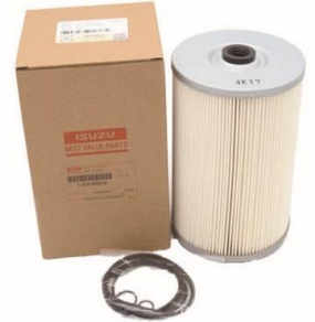
1-87610059-0 机油胶芯 OIL FILTER