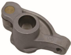
8-97306421-2 气门摇臂(进) ARM; ROCKER