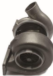
1-14400374-2 涡轮增压器 TURBOCHARGER ASM