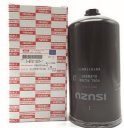
5-87611007-1 柴油滤芯 FUFL FILTER