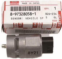
8-97328058-1 里程表传感器 SENSOR; VEHICLE SPD