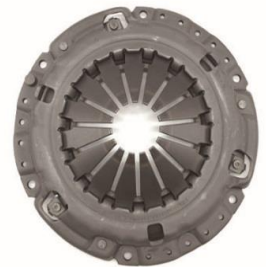
5-87610082-0离合器压盘 CLUTCH PLATE