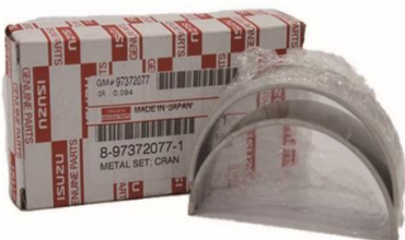
8-97372077-1 曲轴瓦 CRANKSHAFT,STANDARD