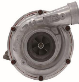
1-87618264-0 涡轮增压器总成 TURBOCHARGER ASM