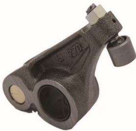
8-97603184-1 摇臂 ARM; ROCKER