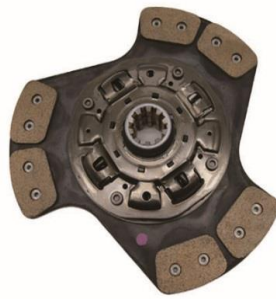
1-31240977-2 离合器钢片 DISC; CLUTCH