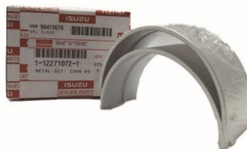
1-12271072-1 连杆瓦 CONN ROD, STANDARD