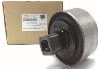
1-87411074-0 扭力胶芯 BUSHING;RUBBER