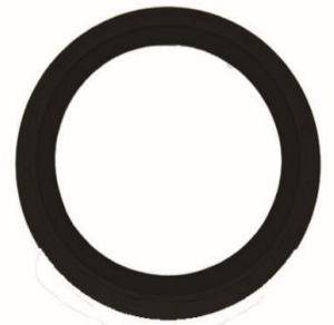
8-97602378-1 曲轴后油封 SEAL; OIL,CRANKSHAFT FRT