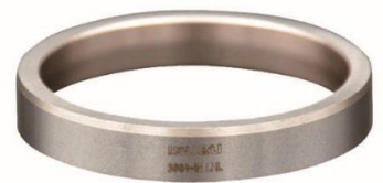
1-87618369-0 气门座 SEAT;VLV INSERT