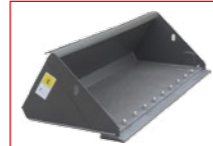
可拆卸刃板, 易更换 Removable blade plate