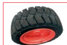
实心胎250-15/300-15 Solid Tire 250-15/300-15