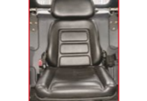
高档减震座椅 Damping seat