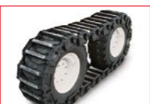
钢制-轮胎式履带 Steel - rubber-tired track