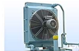
Complete oil cooler