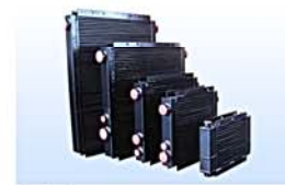
Cooler for compressor