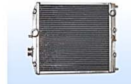
All aluminum radiator