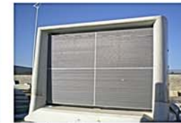
Cooler for wind power