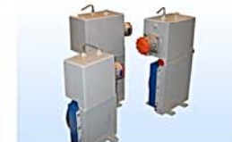
Cooler for blender