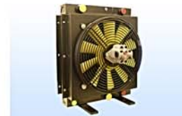
Hydraulic oil cooler