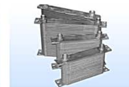
Stacked layer cooler