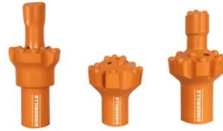
Reamer tools and Domed button bit:

Thread size: R25, R28, SSR28, R32, SSR32, R35, SSR35, R38, T38, T45, T51, SST58, SST68, SGT60. Diameter: 38mm to 152mm Face type: Flat front, Drop center front, Uni-face Skirt type: Normal, Retrac Head type: Cross and button