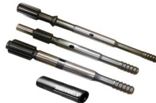
Shank adapter and Coupling sleeve:

Taper degree: 4° 46', 7° , 11° , 12° Carbide type: Chisel type, Cross type, Button type Diameter: 26mm to 60mm