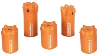
Taper drill bit:

Thread size: R22, R25, R28, SSR28, R32, SSR32, T38, T45, T51, GT60 Rod size: Hex. 22, Hex. 25, Hex. 28, Round 32, Round 39, Round 46, Round 52, etc. Length: 600mm to 6059mm