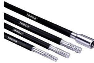
Thread drill rod:

Integral drill rod: Shank size: Hex.19 x 108mm, Hex.22 x 108mm, Hex.25 x 108mm Length: 400mm to 7108mm Head diameter: 26mm to 42mm Taper degree: 4° 46', 6° , 7° , 11° , 12°