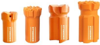
Threaded drill bit:

Thread size: R25, R28, SSR28, R32, SSR32, R35, SSR35, R38, T38, T45, T51, SST58, SST68, SGT60. Diameter: 38mm to 152mm Face type: Flat front, Drop center front, Uni-face Skirt type: Normal, Retrac Head type: Cross and button