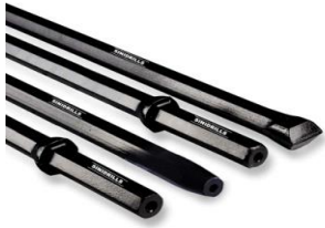
Small hole drill rod:

Thread size: R28, SSR28, R32, SSR32, R35, SSR35 Pilot adapter head diameter: 26mm to 40mm Reaming button bit diameter: 64mm to 127mm Domed bit diameter: 76mm to 152mm