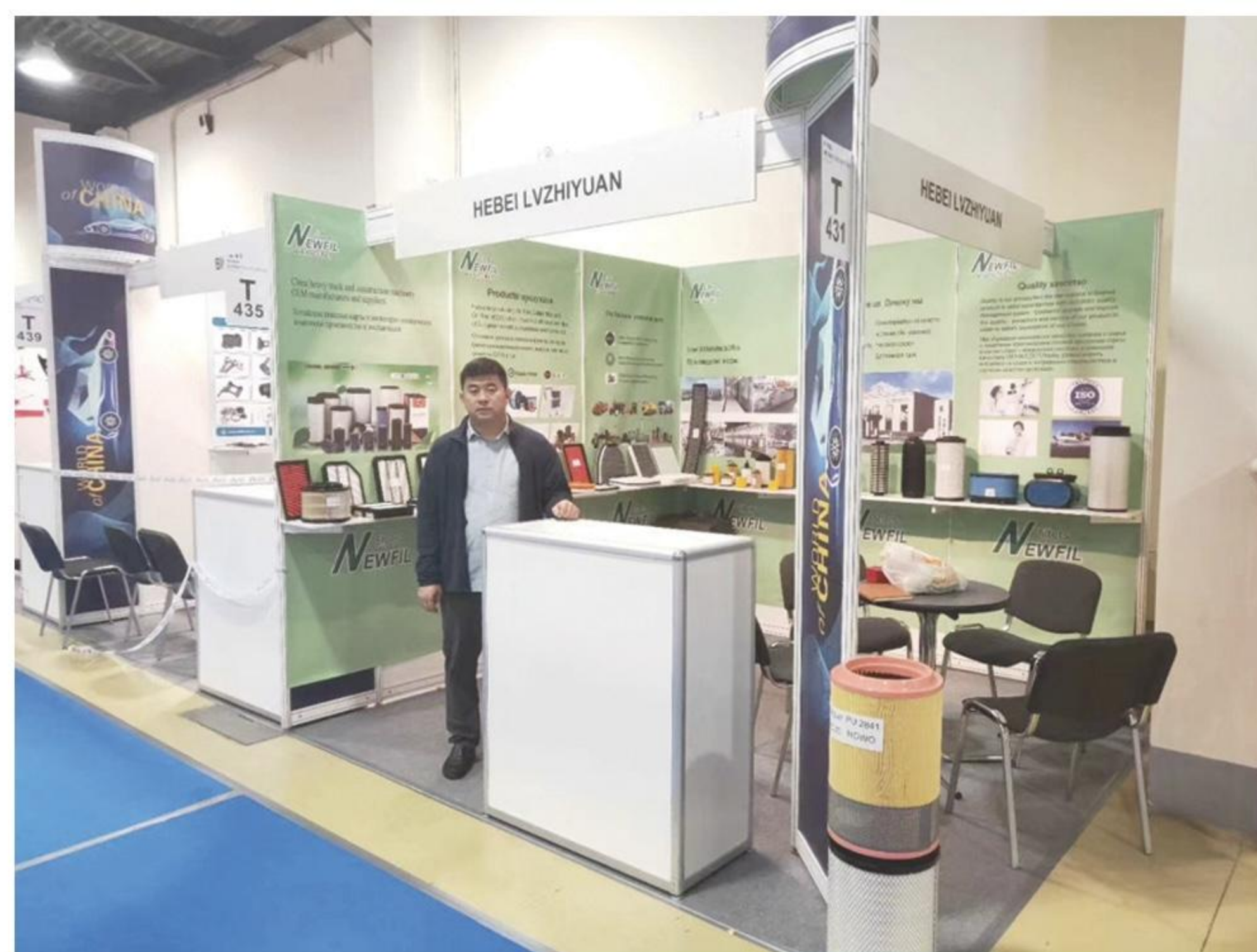
MIMS AUTOMECHANIKA MOSCOW 2019