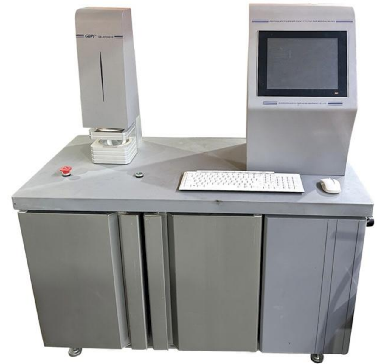
PARTICULATE FILTRATION EFFICIENCY TESTER