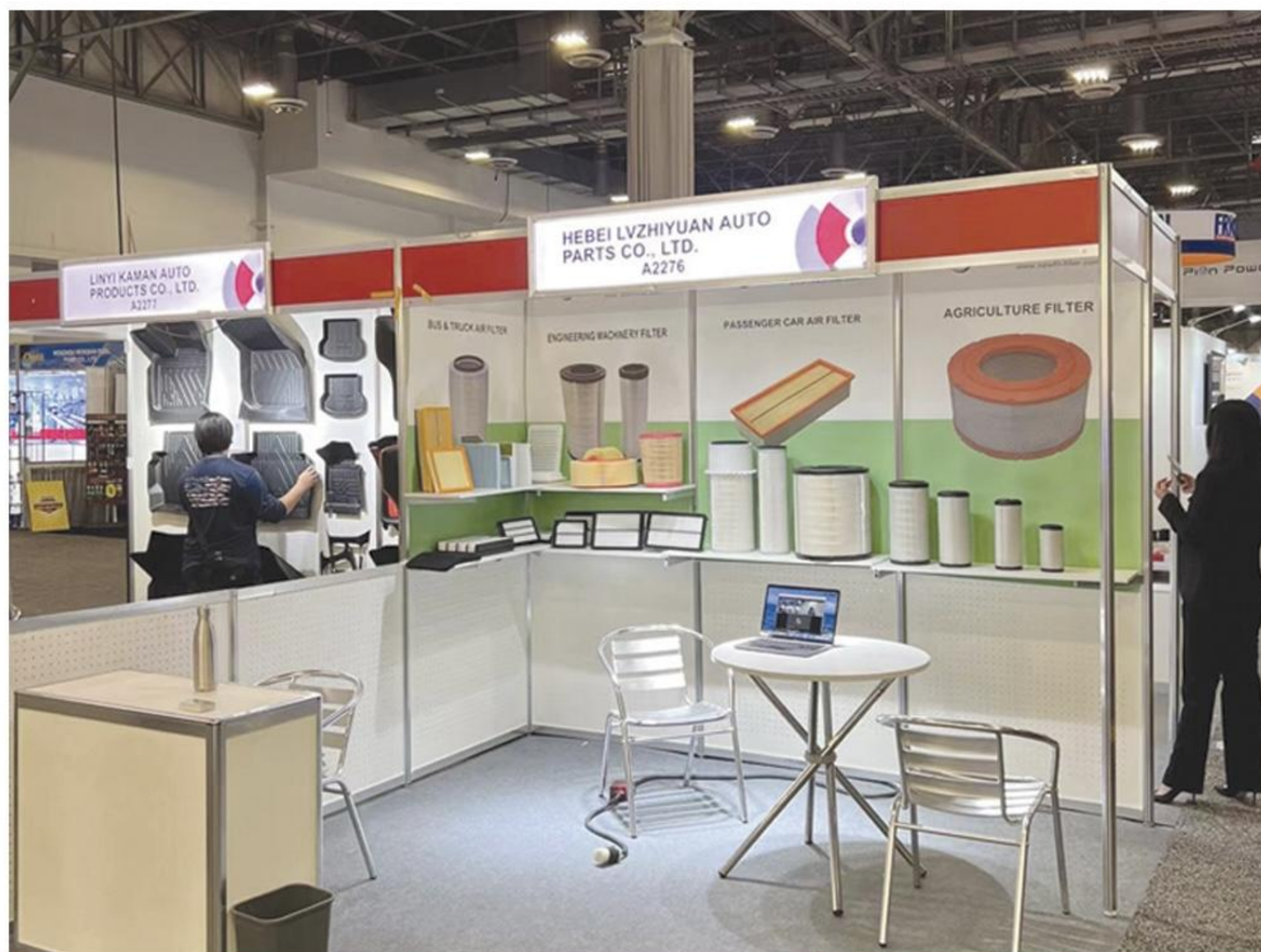
AAPEX (LAS VEGAS) 2022