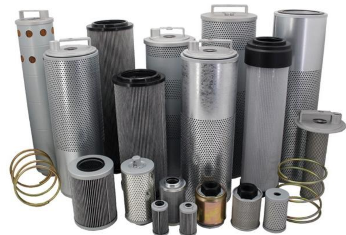
Engineering Machinery Filter