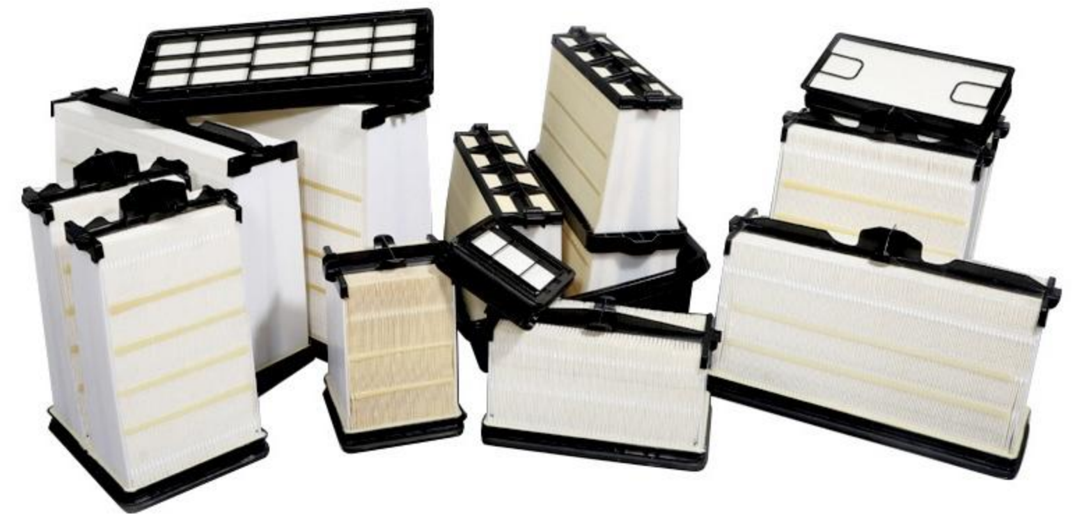
Generator set filter