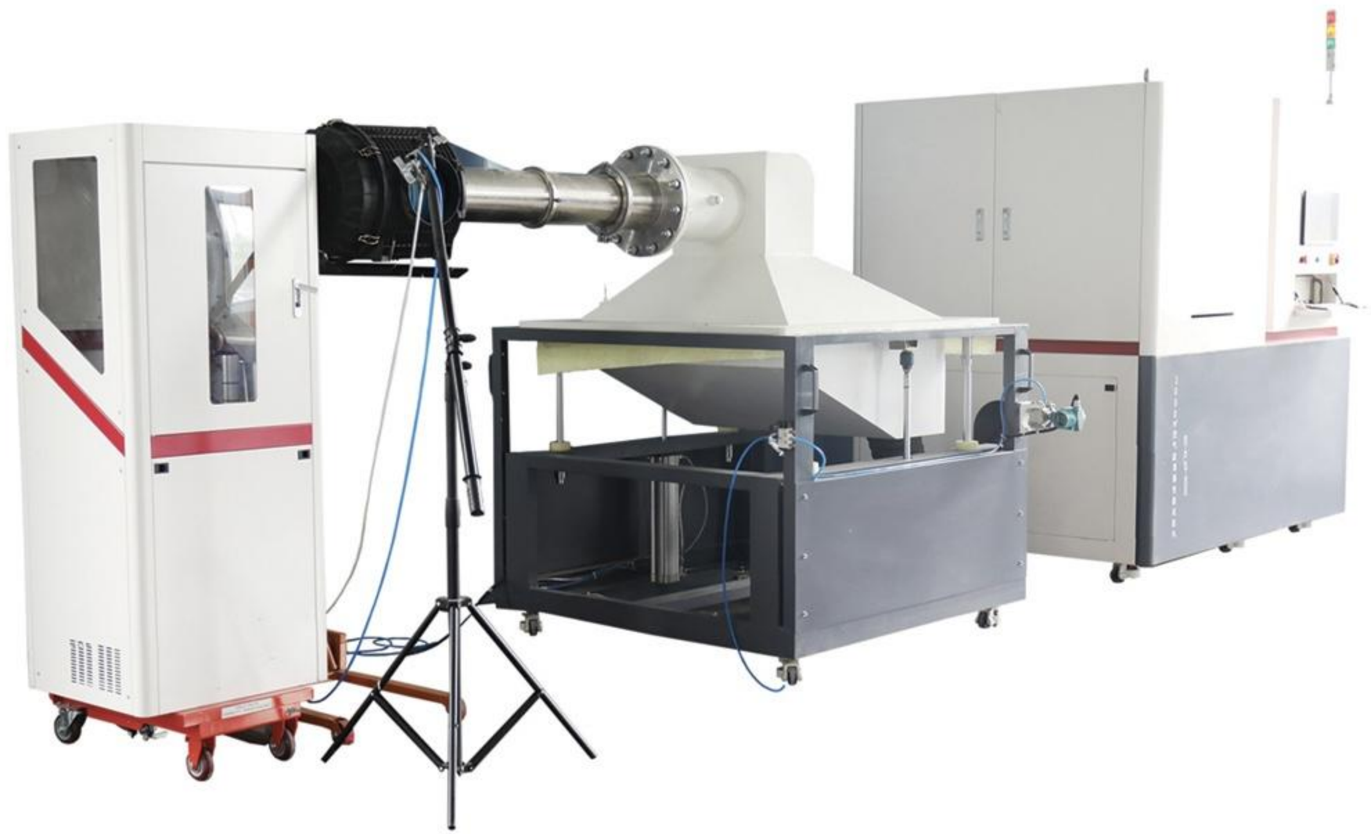
AIR FILTER PERFORMANCE TEST EQUIPMENT