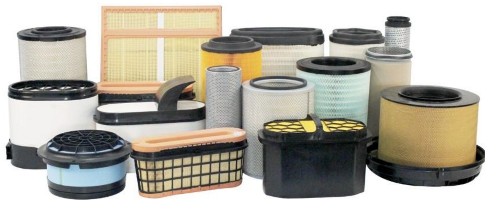
Bus & Truck filter