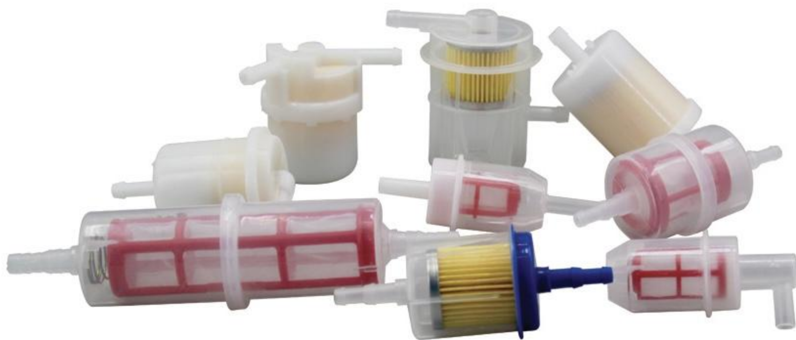
Oil & fuel filter