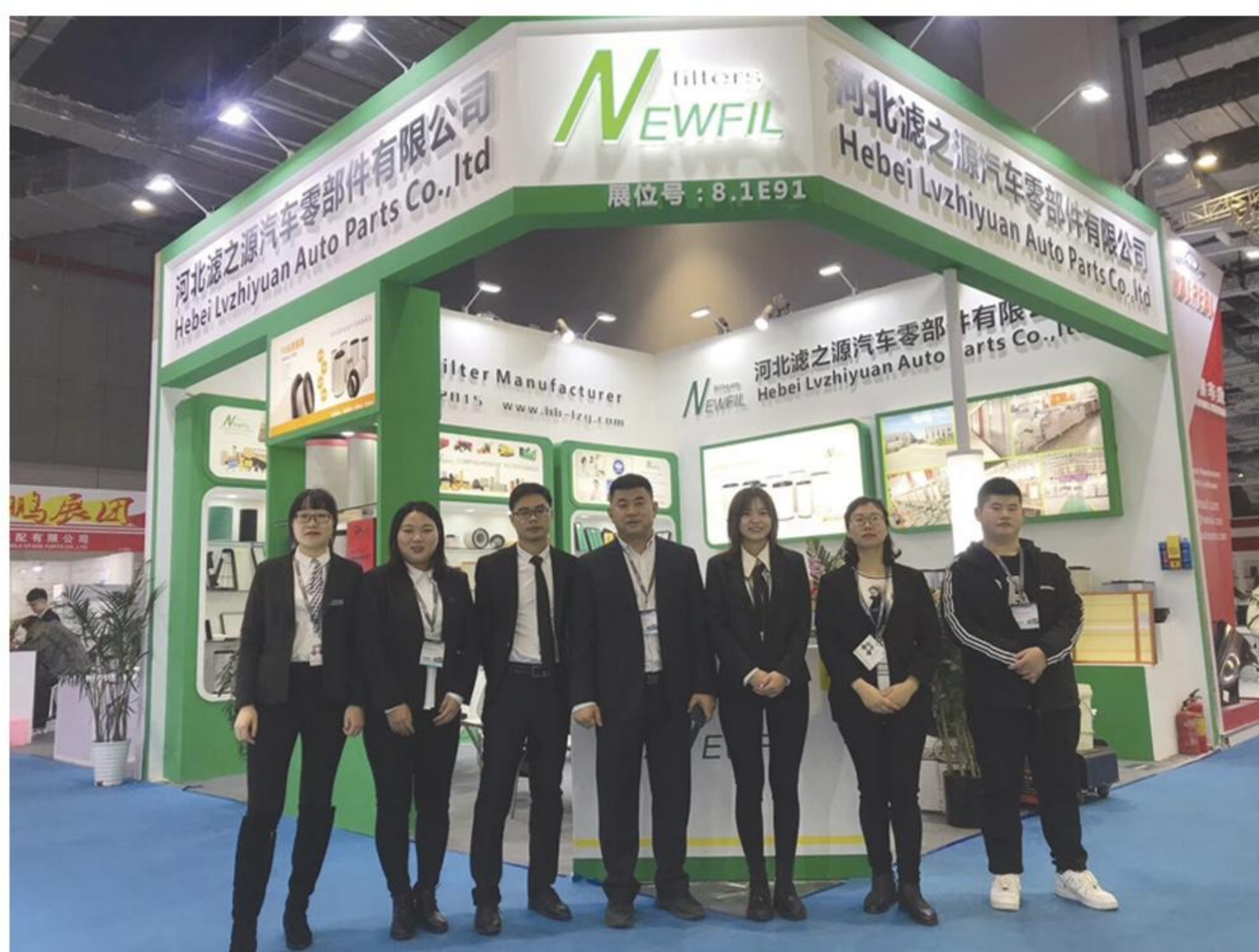
AUTOMECHANIKA (SHANGHAI) 2019