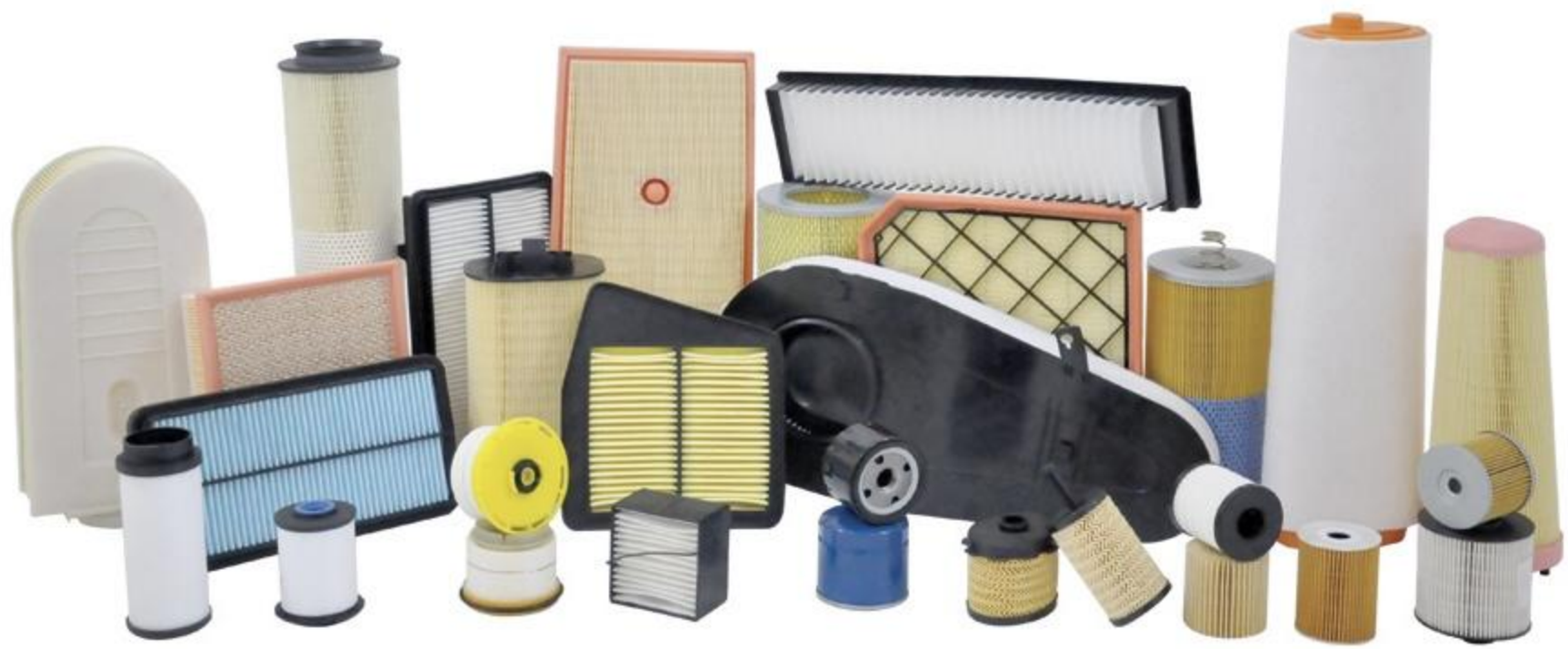
Passenger Car Filter