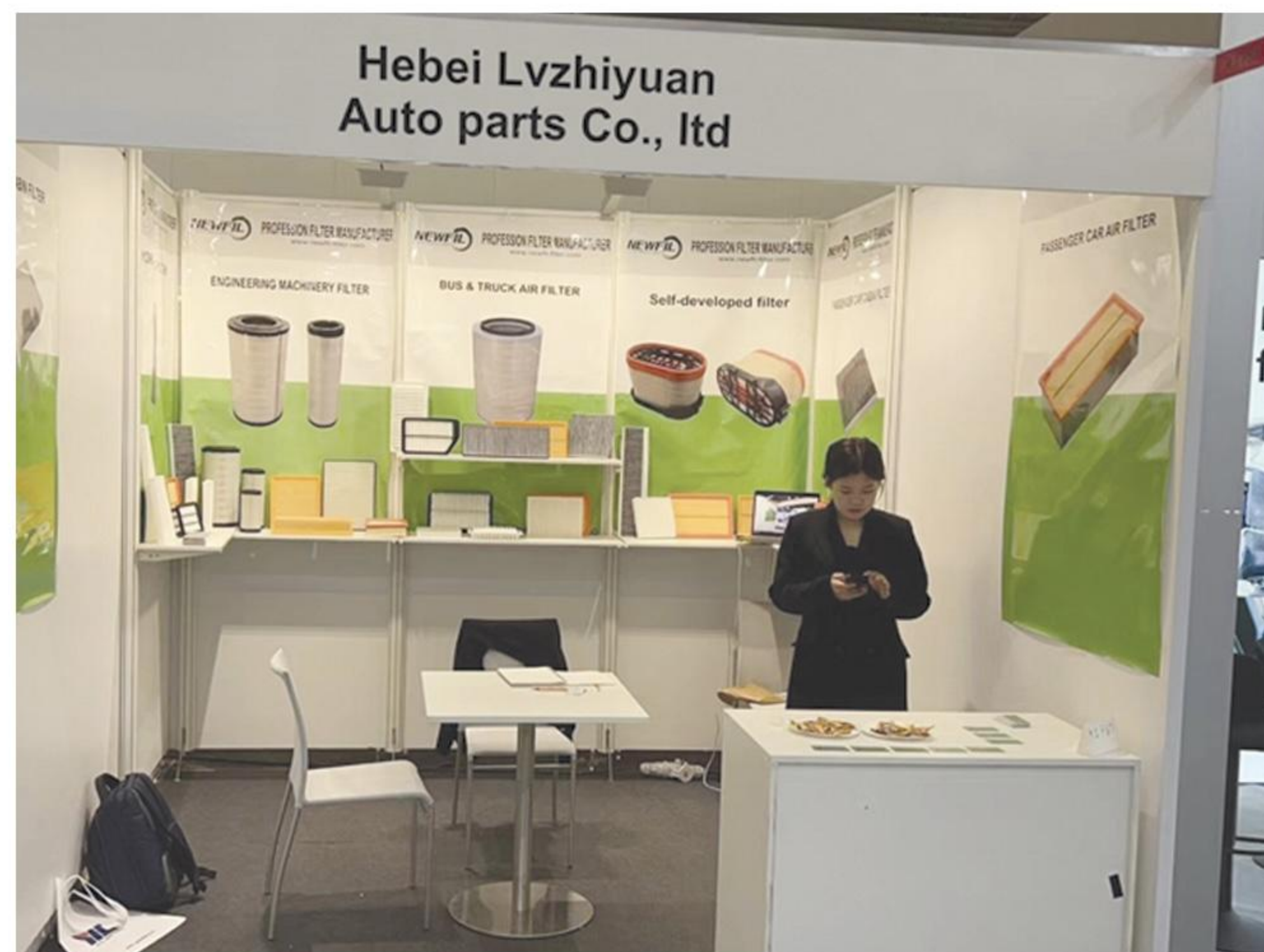
AUTOMECHANIKA (FRANKFURT) 2022