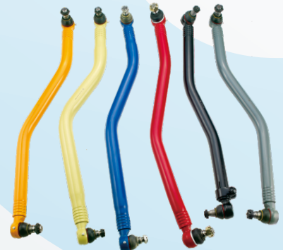
CENTRE ROD ASSEMBLY