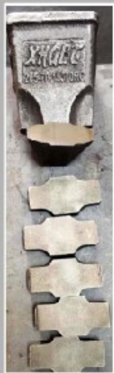
The sample cut detection

Make sure the quality meet with the requirements and reach to the standard.