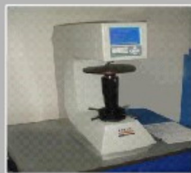
Rockwell Hardness Tester