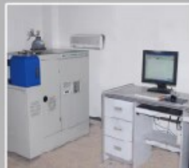
Optical Spectrum Analyzers