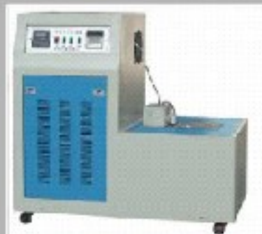
Low temperature impact machine