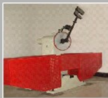
Impact Testing Instrument