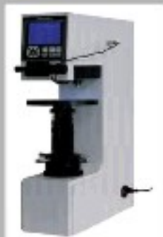
Brinell hardness tester