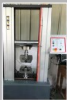
Tensile testing machine