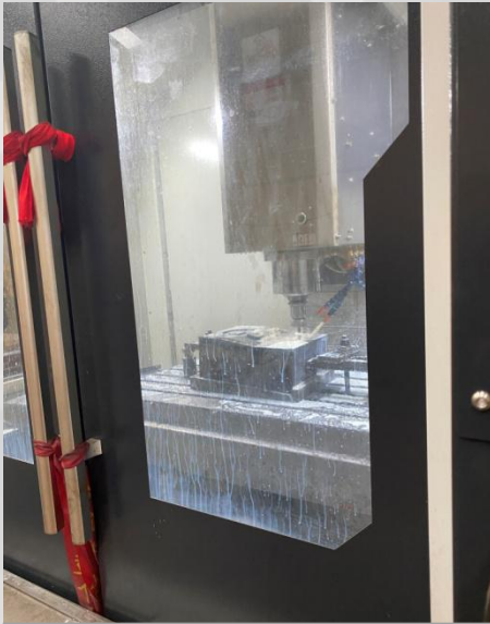
CNC milling machine