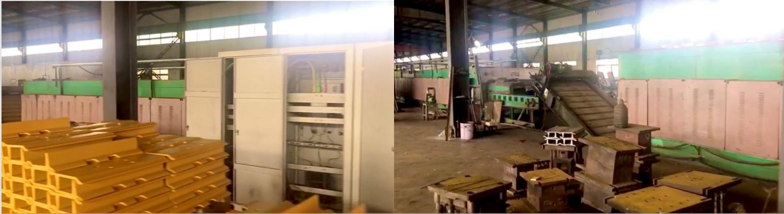
Heat Treatment Line