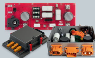
HIGH VOLTAGE SOLUTIONS