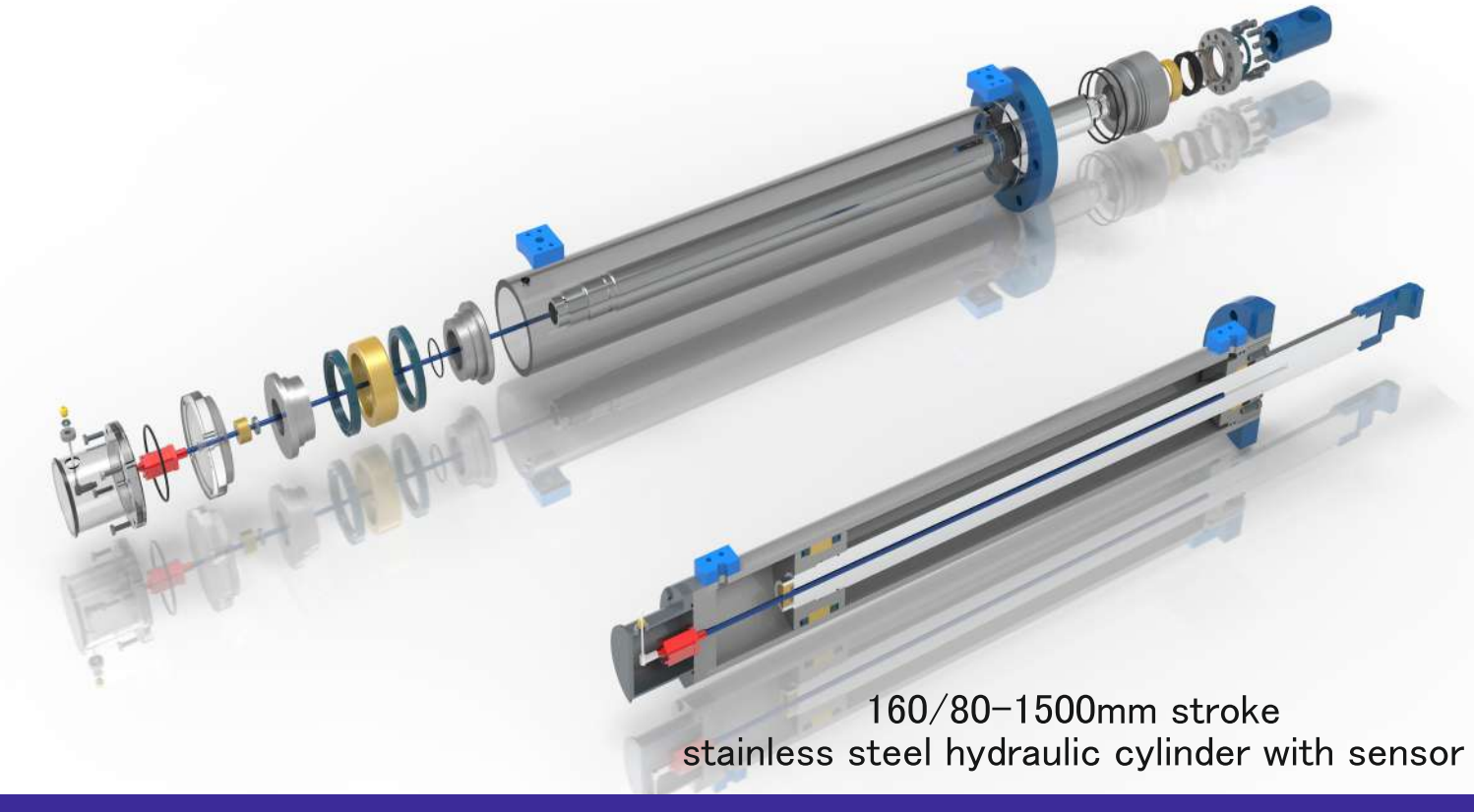
160/80-1500mm stroke stainless steel hydraulic cylinder with sensor

With production quality, service and ongoing investments Ortaklar Hydraulic, is hydraulic cylinder manufacturer in TÜRKİYE Since 1975