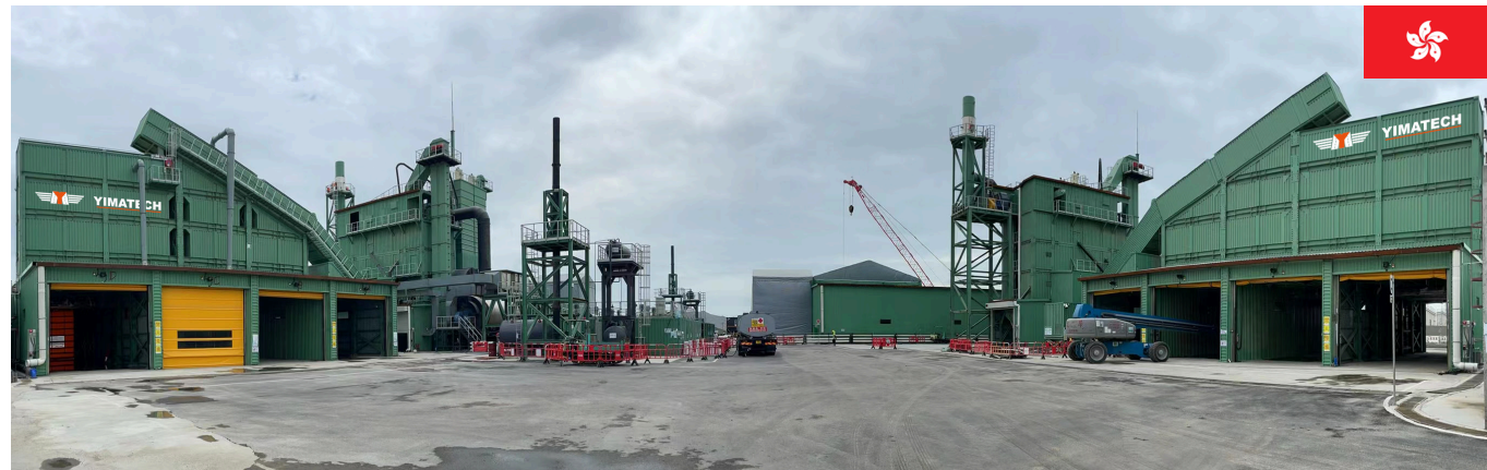
▲ CSM320 HK Airport