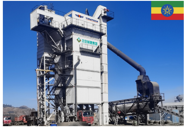
▲ CSM160 Ethiopia