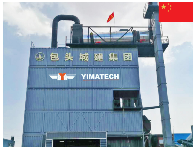
▲ CSM320 Recycling