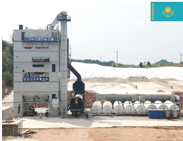
▲ CSM320 Kazakhstan