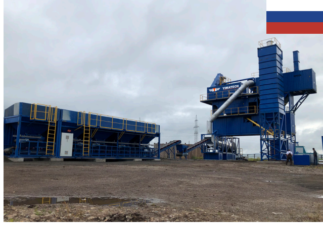
▲ CSM80 Russia